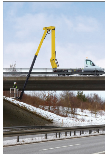
Ability to access below ground